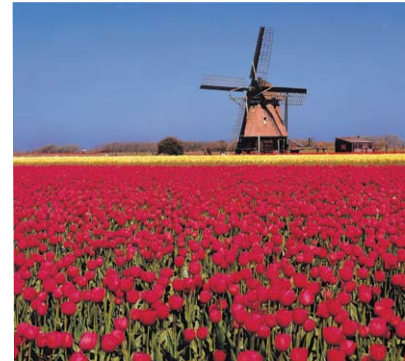
The power of the wind has been harnessed successfully to create clean, renewable energy for centuries all around the world.

If you would like a copy of your personalized scorecard call 1-800-345-6770 ext. 605 .